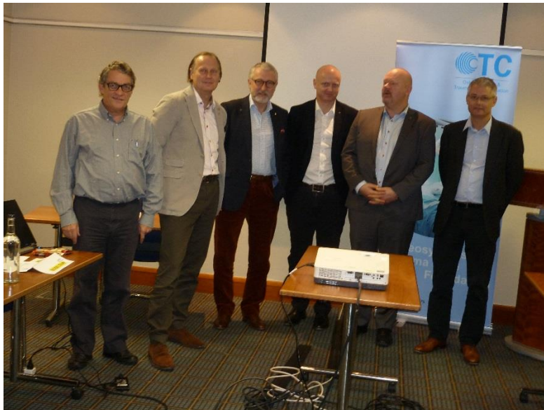
Scandinavian OTC Board Members, London, November 2013

Results were then presented to the AGM where chapter activities and aspirations were reviewed on a region-by-region basis. Synergies among chapters of the same region were identified.