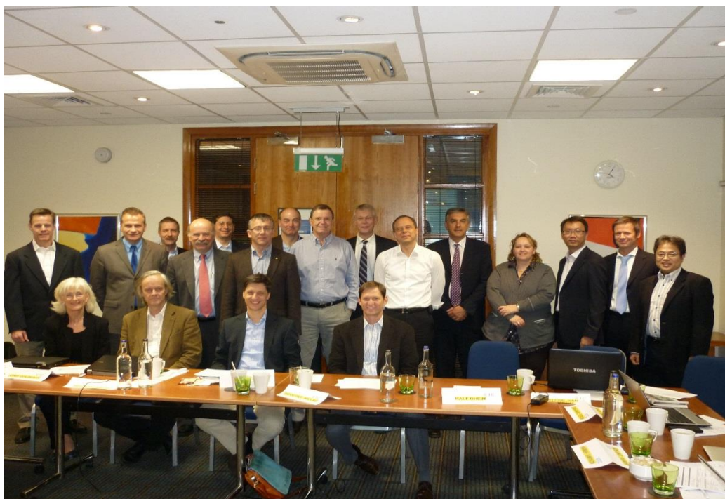
London Workshop Participants and RECO Members, November 2013

Also, publication projects of RECO and planned 2013/2014 workshops in the area of fragility fractures were reviewed. Cooperation with the R&D group of the grantor was discussed and continuing support confirmed.