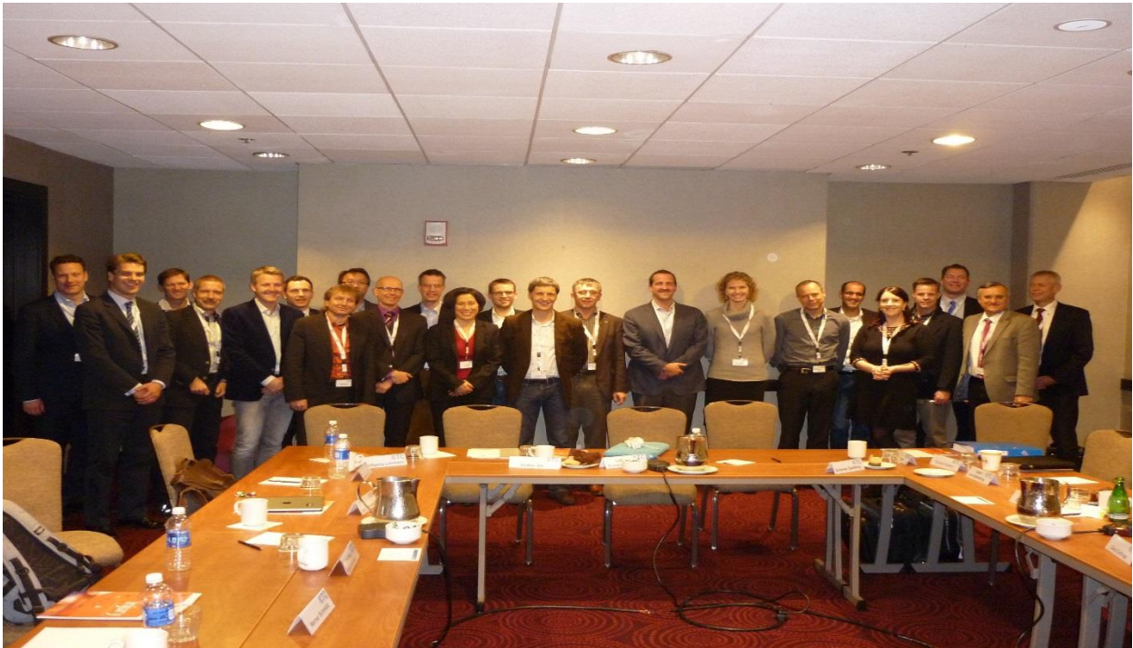
Boston 2014 Workshop participants and RECO members

The presentations and discussion results will be published in a supplement to the journal INJURY.