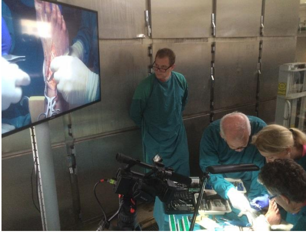
Cadaveric Course Gothenburg