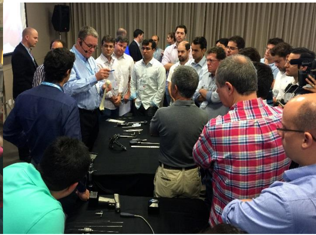
Sao Paulo Workshop session