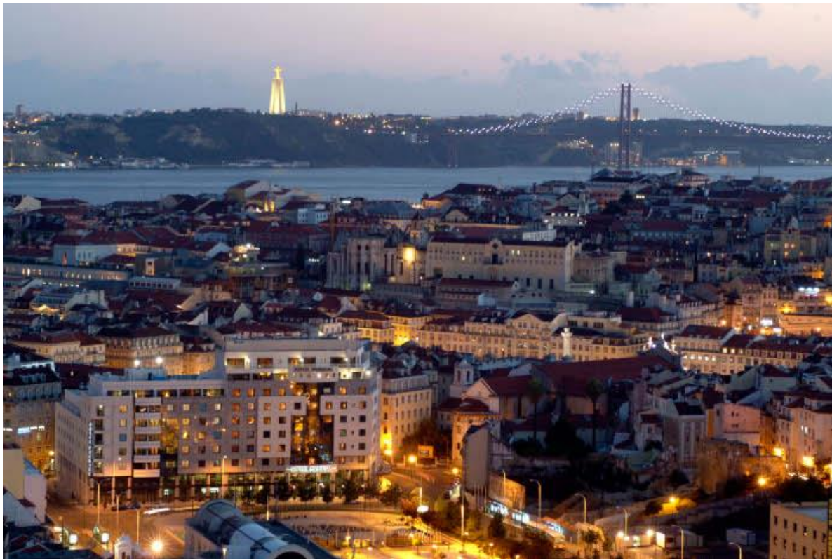
Lisbon, venue of the annual meetings 2014